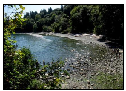
Pocket Beach - Victoria BC, Canada

NOTE: This effective tutorial is \underline{not} by TNN