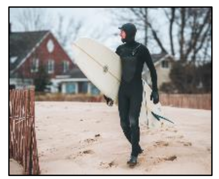
Tips for first-time surfing Great Lakes:

Greatness of the Lakes makes surfing possible; (5,400 cubic miles) of water and 10,900 miles of shore, more than East and West coasts combined!