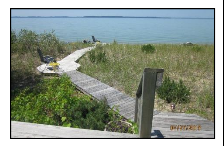
Beach July 2015-water level 580.0

TNN hopes this journey to a greater beach proves to be a round trip to 2015 from conditions July 2020 (below) to the prior boardwalk design (above). This is the third high water period in our lifetime. It has been the worst season of them all for erosion.